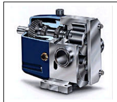
Figure 3. Lobes in lobe pumps do not make contact, because they are driven by external timing gears. This design handles low-viscosity liquids