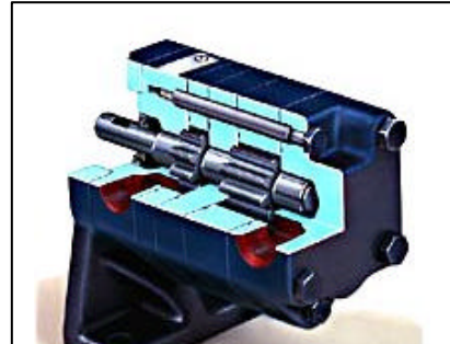
Figure 2. External gear pumps (shown is a double pump) are typically used for high-pressure applications such as hydraulics.

Lobe pumps are cleaned by circulating a fluid through them. Cleaning is important when the product cannot remain in the pumps for sanitary reasons or when products of different colors or properties are batched.