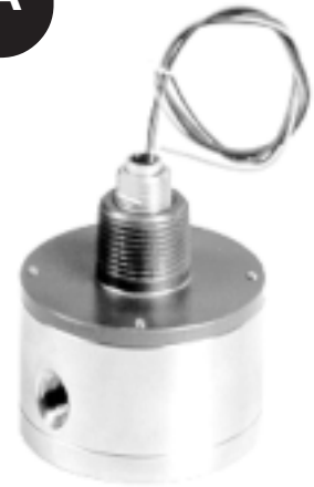
TM03ASRS Representative Model

With only two moving parts and exceptional pressure loss characteristics, Mini Oval is the intelligent approach to metering systems. With flow rates in 0.03-20 GPM range, this versatile Mini Oval Series offers non-factored pulse output and is compatible with all electronic registers.