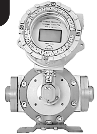
TS10AC0E Representative Model