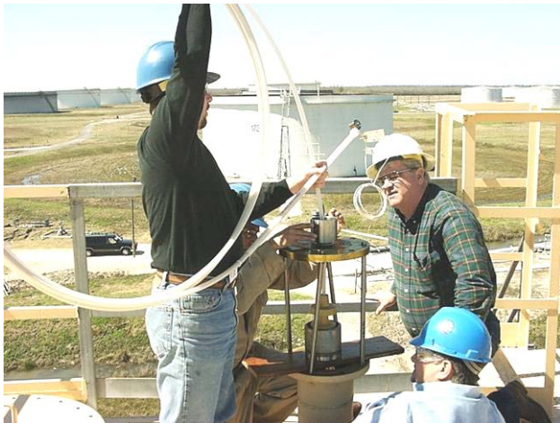
Installing Flexible DataStik™ (for tanks up to 50 ft.)

For More Information, Please Contact: OMNTEC Manufacturing, Inc. 1993 Pond Road Ronkonkoma, NY 11779 USA Office: (631) 981-2001 Fax: (631) 981-2007 Email: omntec@omntec.com Website: www.innovative-sensor.com