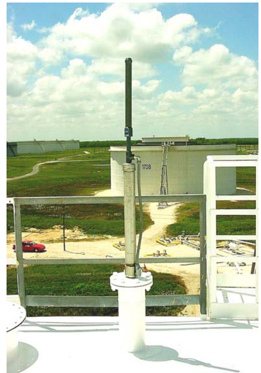
DataStik™ Installed on Storage Tank

True "Stand-Alone" Tank Gauging No power or wiring required! Tanks up to 50 ft!